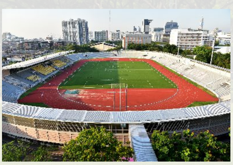
Chulalongkorn University Stadium