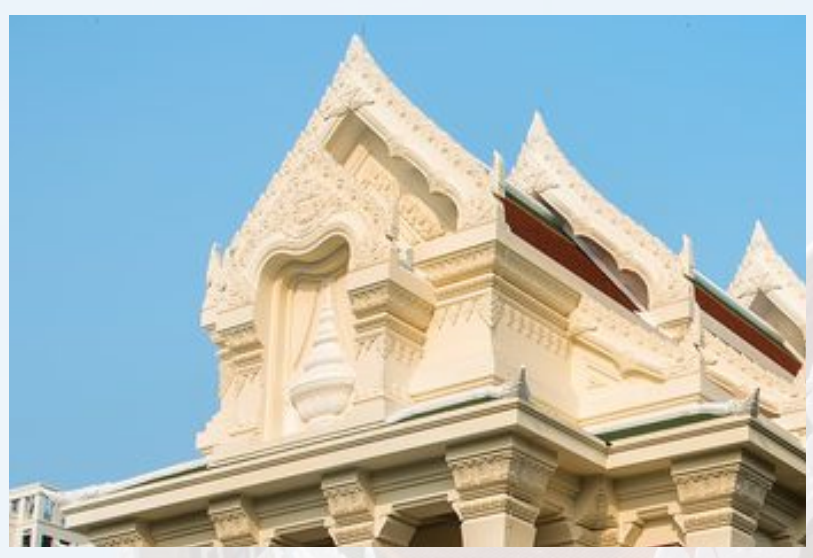
"Phra Kieo", emblem of Chulalongkorn University at the pediment of Chulalongkorn University Auditorium