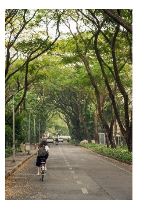
A bicycle lane is provided to promote the use of environmental-friendly