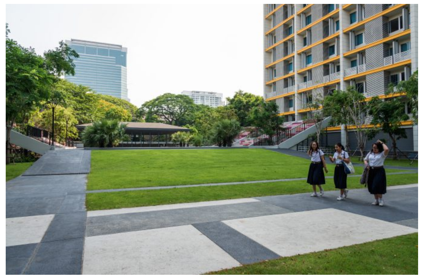
Former 25m swimming pool was turned into Chulachakrabongse Plaza, a public park between the Faculty of Science and the Faculty of Engineering