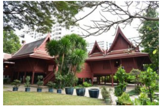
Traditional Thai House cluster was erected to promote arts and cultural activities.