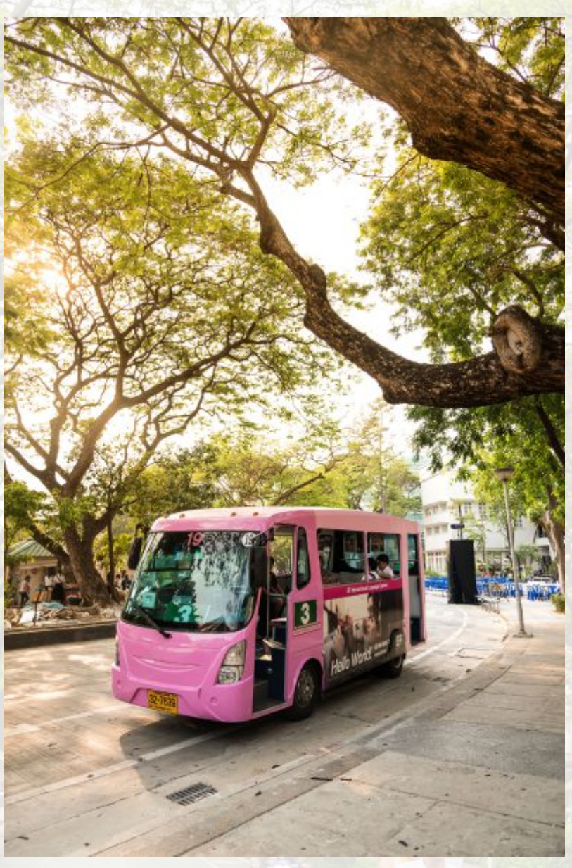
Five-line free university shuttle service connect the campus with nearby public transportation hubs.