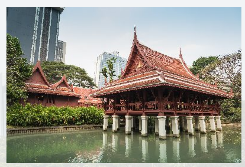
Traditional Thai House Complex at Chulalongkorn University Cultural Center