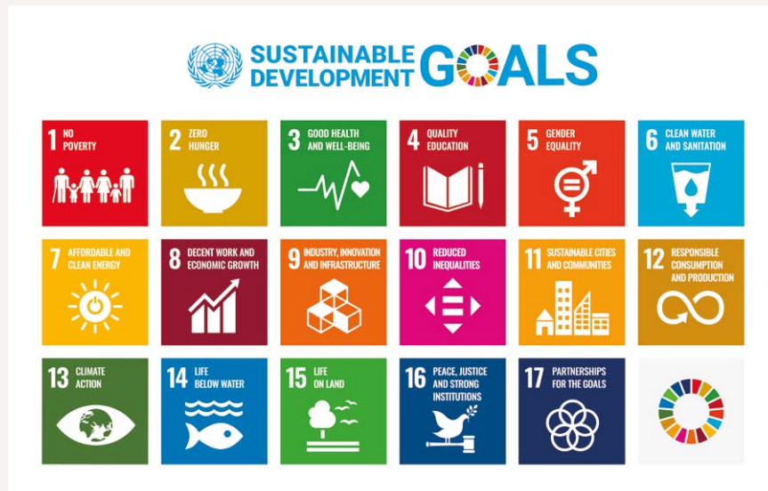
United Nations Sustainable Development Goals (SDGs)

This pledge has now materialised as the universities' shared theses on sustainable development and responsibility, presented in this document. More than 400 members of the university community participated in formulating the theses and commenting on them in the UNIFIkeke seminar on sustainable development in September 2020.